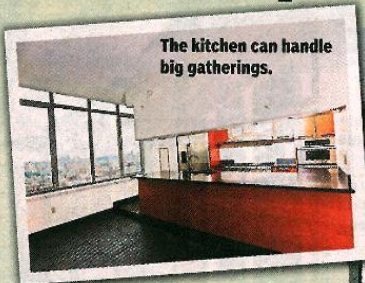
The kitchen can handle big gatherings.

The unit has four bedrooms, including two master suites, as well as an office space on the